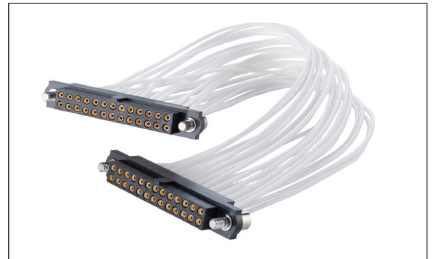
Datamate J-Tek double-ended female cable assembly

Ideal for prototyping, small builds, or higher volume production, these cable assemblies are stocked in standard lengths – 150mm across the range, with additional 300mm and 450mm options (6", 12" and 18"). Built using high quality PTFE-insulated cables and performance connectors from the high-reliability Datamate range, these ready-made harnesses are ready for your extreme environment applications.