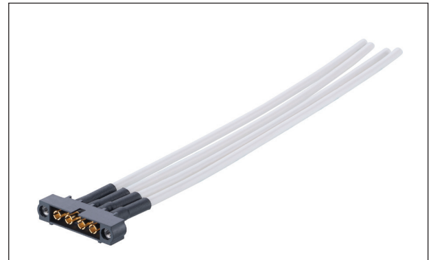
Datamate Power single ended male cable assembly